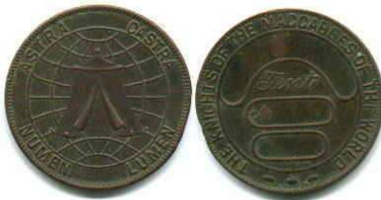
32 mm, copper (or bronze?)